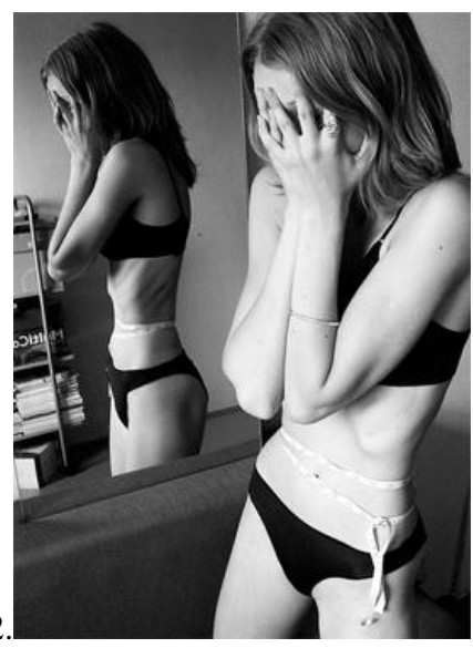
1. and 2. http://anaymiasiempre.blogspot.com/

It is obvious that gender differences do play a role in the situation seen among Argentines. Argentine women are much more likely than Argentine men to develop disordered eating patterns and seek plastic surgery. A greater number of women are affected than men by the beauty cult because women are seen as living up to a different set of expectations. Women are sometimes still seen as objects of beauty rather than individuals with ideas, opinions, and goals. And, not only men hold women to an unrealistic beauty ideal. Some women still old both themselves and other women to an unrealistic, often antiquated, idea of what a woman should be. At younger and younger ages, girls are being indoctrinated with the image of the perfect woman, and many spend the rest of their lives trying to attain an impossible goal. Still, when a person has been bombarded with images of perfection all of their lives, it is nearly impossible to ignore this powerful influence.