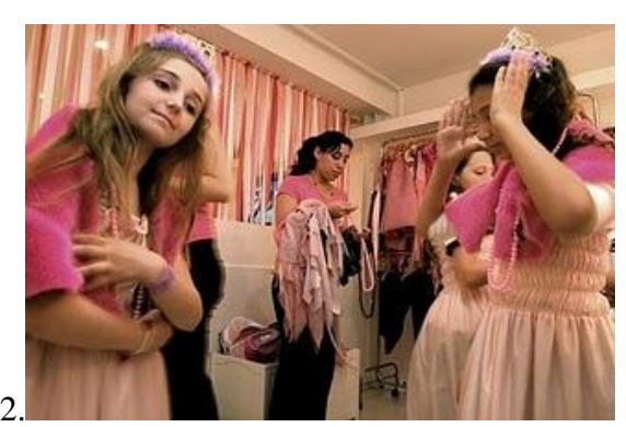
1. and 2. http://www.romancingargentina.com/2008/11/girls-just-wanna-be-barbie.html